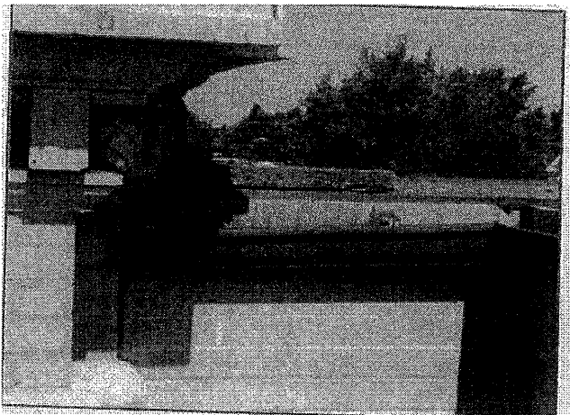
Photo of incorrectly pitched gutter which must be repaired. See # 4 above.