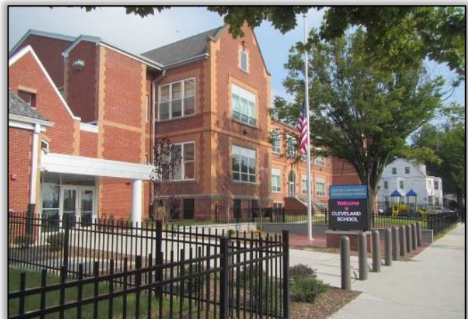
Front of Cleveland Street Elementary School

The celebration included a performance from the Orange High School Mighty Marching Tornadoes Band and the Color Guard. Past and current educators spoke about the history of the school and the renewed hope for the years ahead in a facility that will enhance students' education. Following the event, attendees had an opportunity to tour the renovated facility, led by Cleveland Street School's young scholars. During