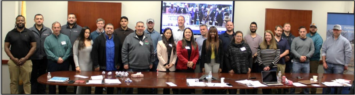
Graduates of the 2024 Contractor Training Program

The SDA's annual Contractor Training Program reflects the Authority's commitment to fostering expertise and growth within the construction industry, particularly for smaller construction-related businesses across the state. By providing the tools and training these firms need to succeed, SDA aims to ensure that New Jersey's school construction projects are delivered with the highest quality and efficiency while promoting economic growth statewide.