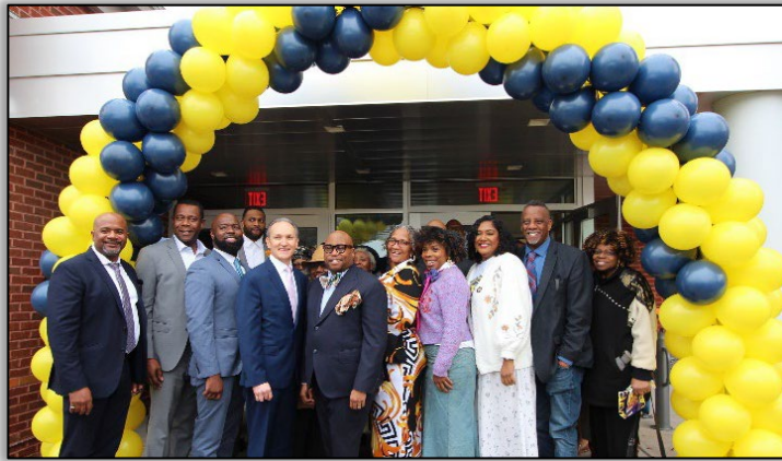
Officials at the Cleveland Street Elementary School Opening Celebration

In February, SDA joined Orange Public Schools' leaders, students, and local officials, to celebrate the Cleveland Street Elementary School addition and renovation project, which opened to students in September 2024.