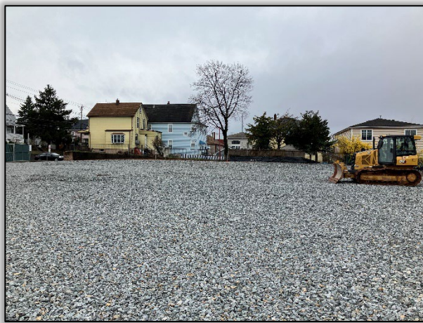
Site ready for construction of a new school in Garfield

The SDA remains committed to the delivery of projects both on schedule and on budget. In its efforts to maximize a predictable outcome, the Authority utilizes a separate early site preparation contract in order to deliver a construction-ready site to a design-builder. During this reporting period, the SDA completed an early site package in Garfield and continued work on another in Elizabeth. In Garfield, the contractor completed the abatement and demolition of the existing 22,000 square-foot Woodrow Wilson School No. 5, and associated site work including site grading. In Elizabeth, demolition of the former 141,000 square-foot Joseph Battin School was completed and site work continued.