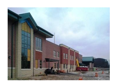
Catrambone Elementary School -Long Branch