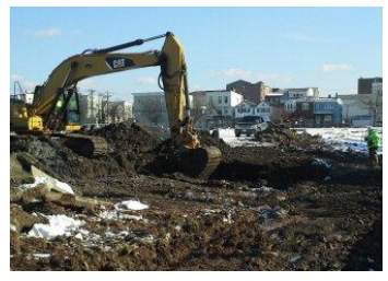
Oliver Street Elementary School -Newark