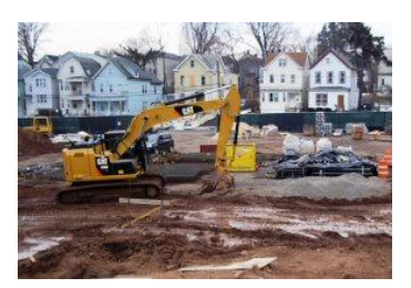
Elliott Street Elementary School -Newark