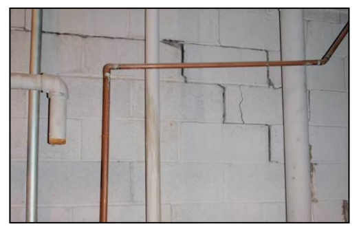
Cracked loadbearing wall that was fixed through an emergent project

Often, emergent projects require significant design work, due to the need for asbestos abatement or other considerations. This sometimes requires that a project have predesign services. Predesign allows for the design consultant to identify the true source of the conditions. A problem may be identifiable by sight, but a determination must still be made as to what is causing the problem so that the remedy selected is the