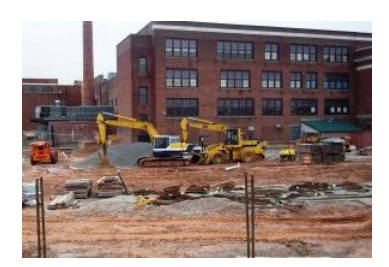
Academic High School - Elizabeth

Since a picture is worth a thousand words, the SDA has striven to keep community members updated on project progress through the posting of monthly progress photos for active construction projects. Progress photos can be accessed on the SDA's website at: <a href="http://www.njsda.gov/Schools/Project_Progress_Photos.html">http://www.njsda.gov/Schools/Project_Progress_Photos.html</a>. Below is a sampling of progress photos from the reporting period.