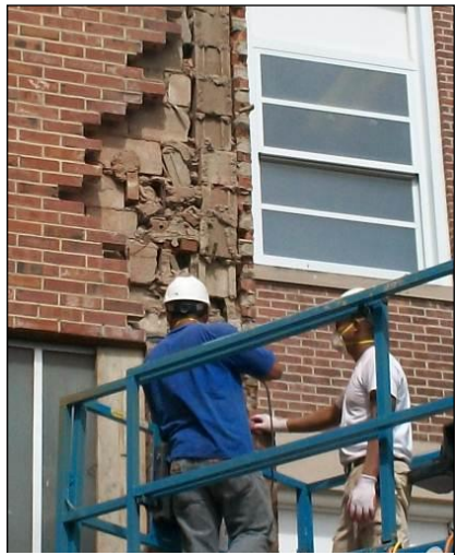
Emergent construction activities at Whitney E. Houston Academy in East Orange.

During the reporting period, the replacement of three different roofing systems at the William B. Cruise Memorial School No. 11 in Passaic was also completed. A $1,516,746 general construction contract was awarded to D.A. Nolt Inc. of Berlin, NJ to replace the existing roofs of the school, which educates more than 1,300 students in grades pre-kindergarten through fifth.