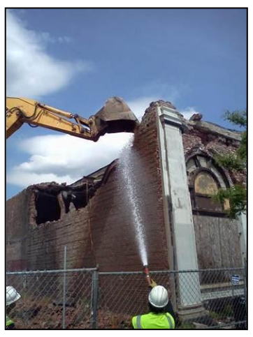
Demolition activities in Jersey City.

This reporting period saw the start of significant activity on a variety of projects. For example, demolition and remediation work began on a site in Jersey City. Because the buildings were severely deteriorated, the abatement and demolition of