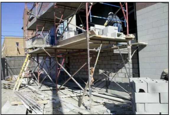
evaluated and analyzed by the SDA for the most cost effective and timely course of action for the State. With a new plan of action in place, the Authority advanced the Victor Mravlag project and is directly managing the construction of the project.