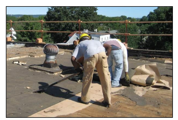
Emergent construction activities at Dionne Warwick Institute in East Orange.

During the first two years of the Christie Administration, SDA started construction on 32 SDA-managed emergent projects—23 in 2010 and nine in 2011. A total of 81 additional emergent conditions were addressed during that time through delegation—where the SDA funded the projects, but the districts themselves managed them. More emergent projects have been completed during Governor Christie's tenure than during that of any other governor.