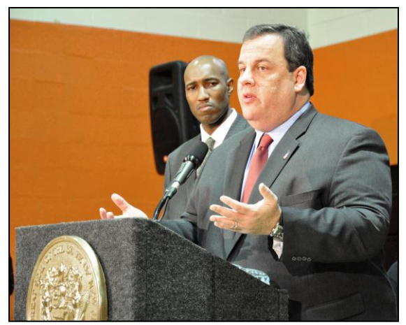
Governor Christie announces the 2012 Capital Portfolio.

Exactly one year after Governor Christie announced the advancement of the 2011 Capital Project Portfolio, he announced an additional 20 projects set to advance in 2012 as part of the SDA's Capital Program. This announcement continues the Governor's commitment to implementing meaningful reforms and key changes providing the SDA the means to construct school facilities projects efficiently and cost effectively.