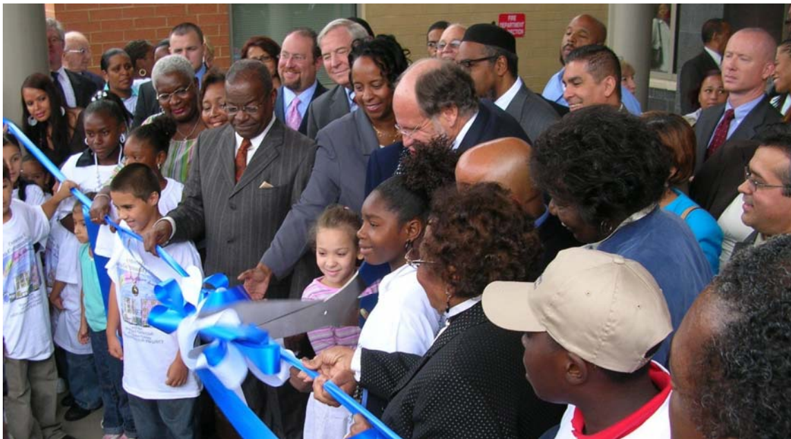
Governor Jon S. Corzine cuts the ribbon for Octavius V. Catto Community School in Camden

New Jersey Schools Development Authority 1 West State Street Trenton, NJ 08625-0991