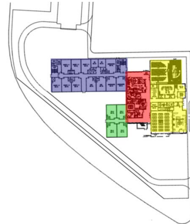
Paterson – PS 16