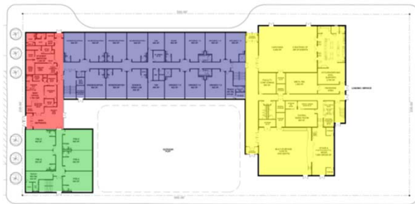
New Brunswick – A. Chester Redshaw Elementary School