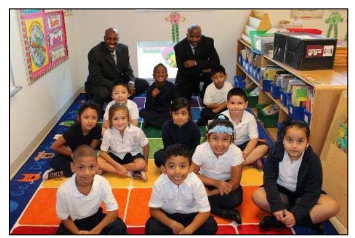
Visiting with first grade students at Elementary School Number 2 in Linden

Since the resumption of the grant program in May 2010 through December 7, 2012, the SDA executed 882 grants providing $276.3 million to local districts and leveraging projects estimated at a total amount nearing $638.8 million. This includes recent grant executions in Brick Township (Ocean County) which received ten grants totaling more than $2.1 million, the Burlington County Special Services School District (Burlington County) which received two grants totaling more than $1 million and the West Morris Regional High School District (Morris County) which received one grant totaling nearly $160,000.