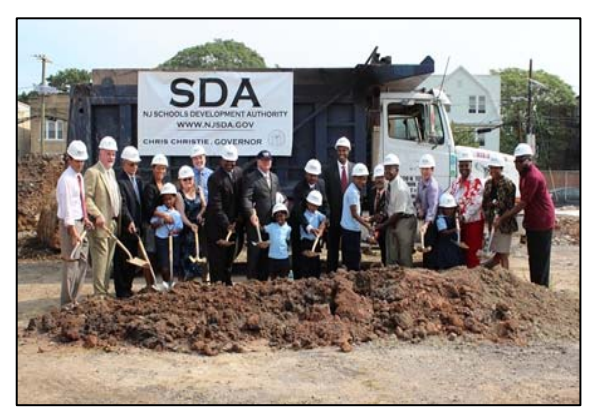
Groundbreaking at Public School #20

grades. The building is being constructed on the site of the former Elberon Elementary School which was demolished in 2009. The facility will include 41 classrooms, four special education classrooms, a cafetorium, stage, computer room, gymnasium, media center/library, art room and a music room. The new school is anticipated for completion in time for a September 2014 school opening.