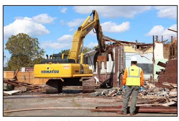
Demolition of Caruso Elementary School

The construction of the new Caruso Elementary School will provide an additional 736 seats for students in kindergarten through fourth grades. The estimated advertisement date for this design-build project is the third quarter of 2013.