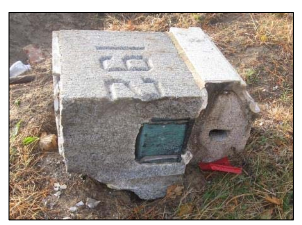
Time capsule found during demolition activities

In November, during demolition, a time capsule dated 1921 was discovered, encased in the cornerstone of the building. The time capsule was carefully removed from the cornerstone by hand with a chisel in order to preserve its contents. Among the items discovered in the time capsule were six "one cent" coins dating back to the early 1800's, a copy of The Keansburg Beacon dated December 15, 1921, a few photos and a program from the Dedication Ceremony at which the time capsule was placed in the cornerstone. The district intends to display the contents of the time capsule in the new school.