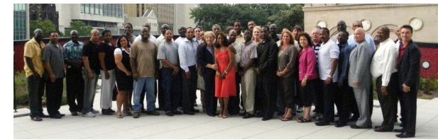
Above: Participants who successfully completed the 2010 program

Don't miss your chance to gain valuable knowledge on how to do business with the SDA.